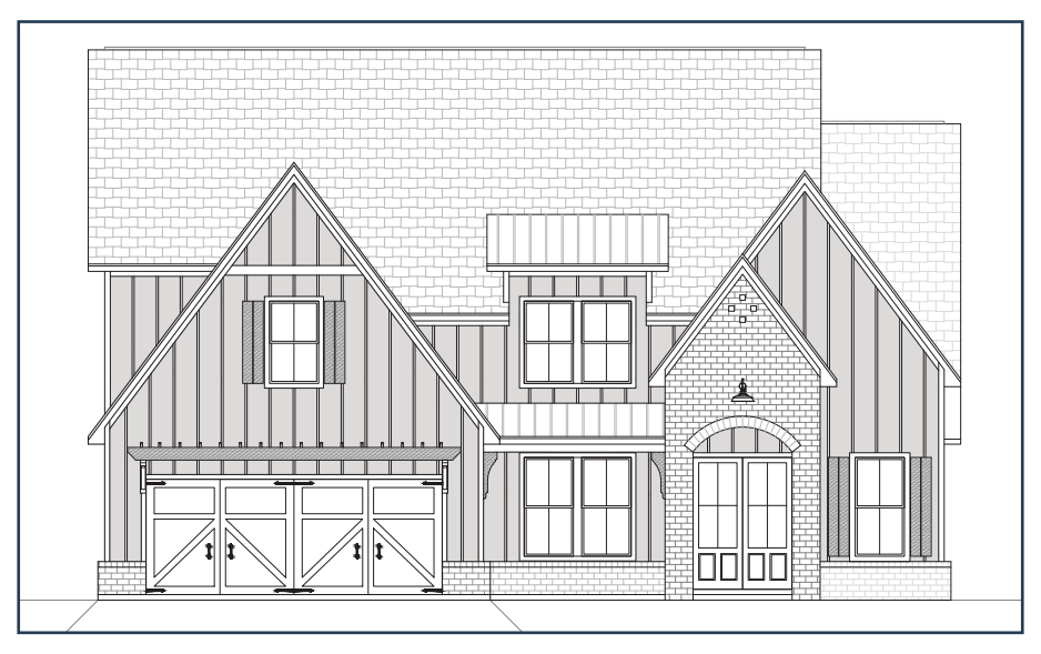
GRACELYN B - FRONT ENTRY