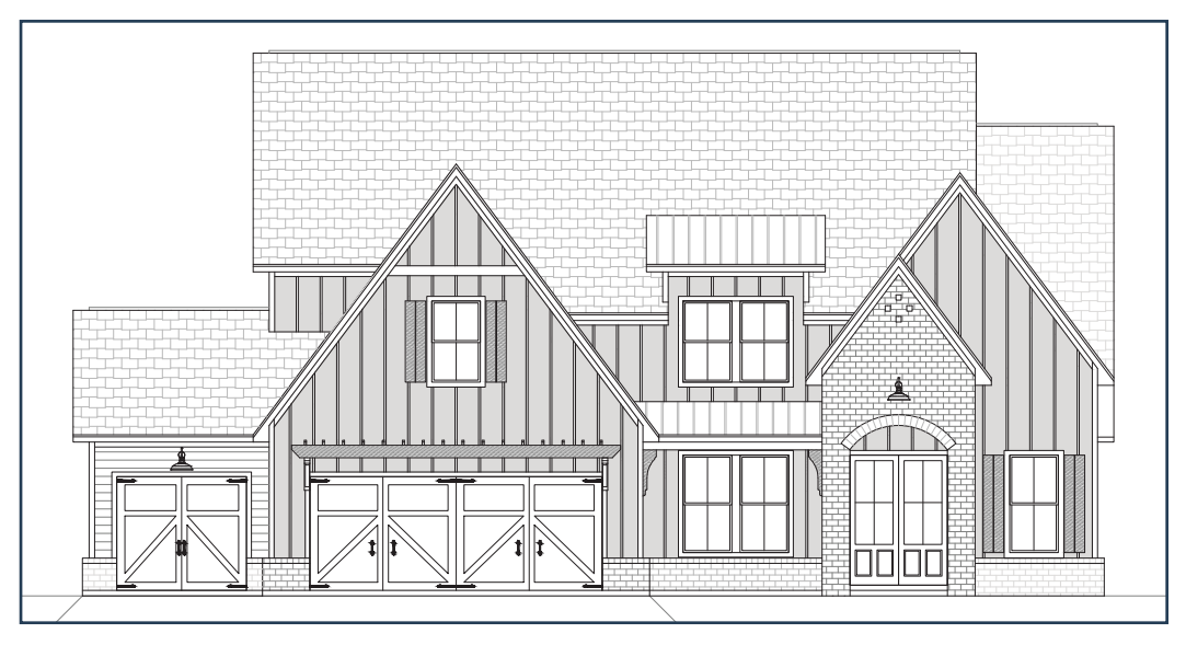
GRACELYN B - FRONT ENTRY - 3 CAR GARAGE