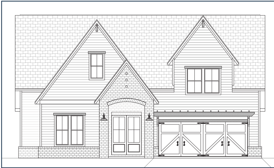
SCARLETT B - FRONT ENTRY