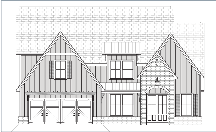
GRACELYN B - FRONT ENTRY