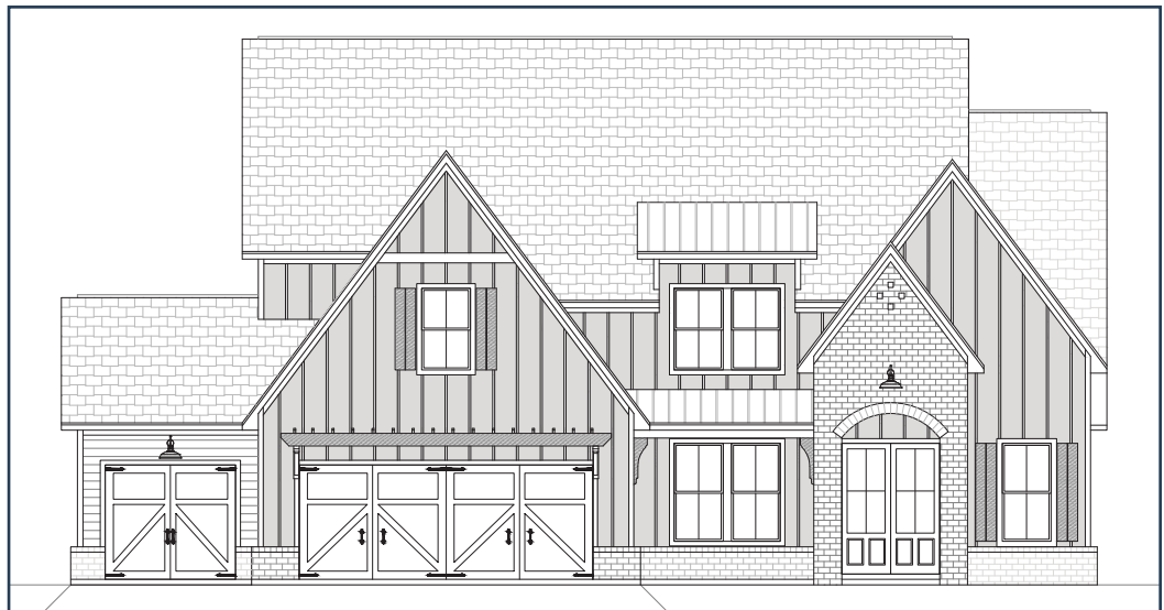
GRACELYN B - FRONT ENTRY - 3 CAR GARAGE