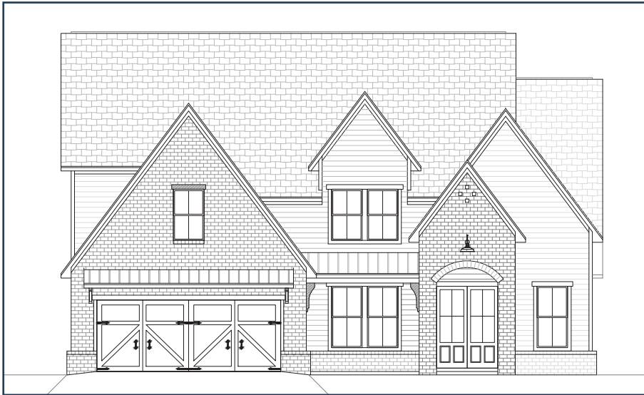
GRACELYN A - FRONT ENTRY