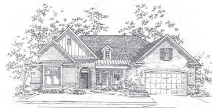
ELEVATION C Traditional