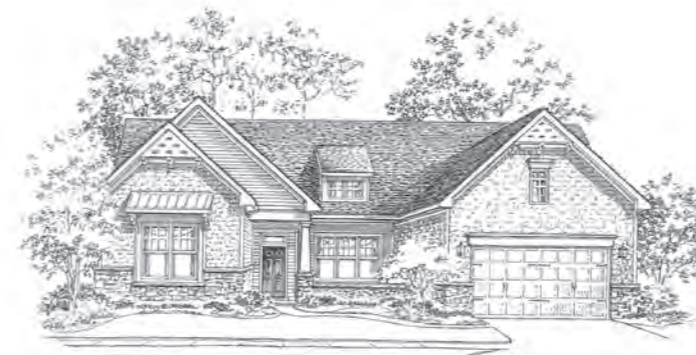
ELEVATION B Cottage Style