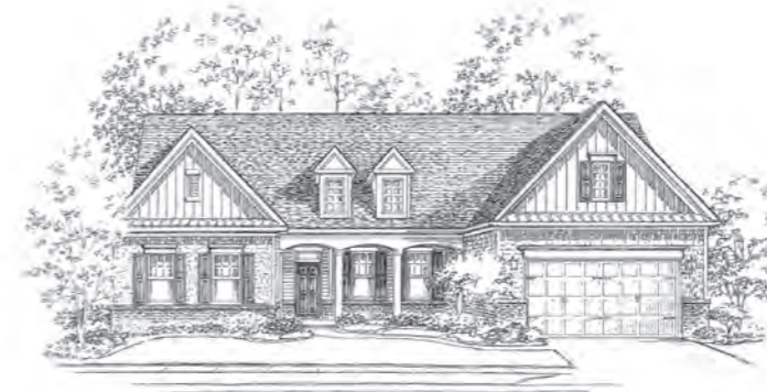
ELEVATION A Country Fair