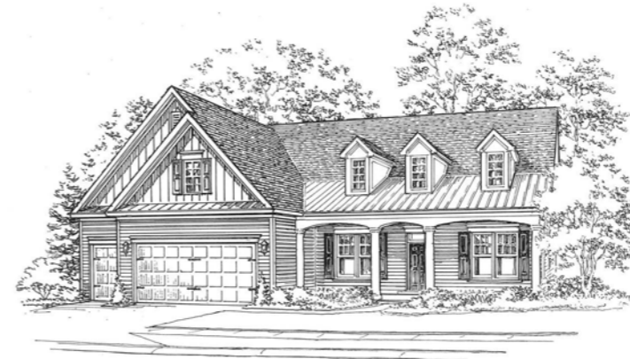
ELEVATION A Country Fair