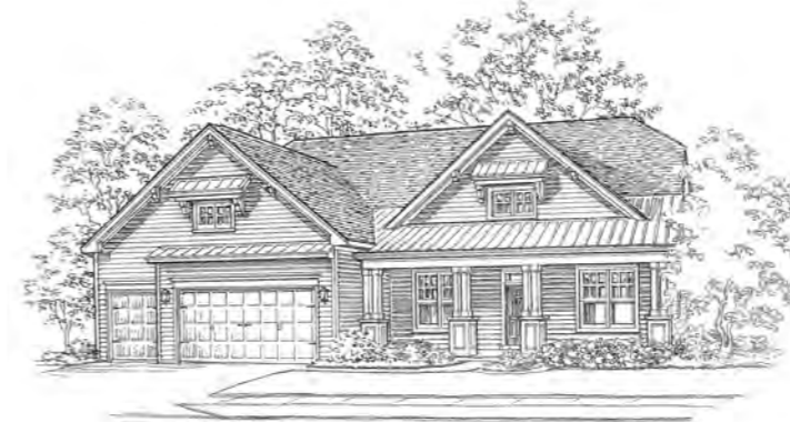
ELEVATION B Cottage Style