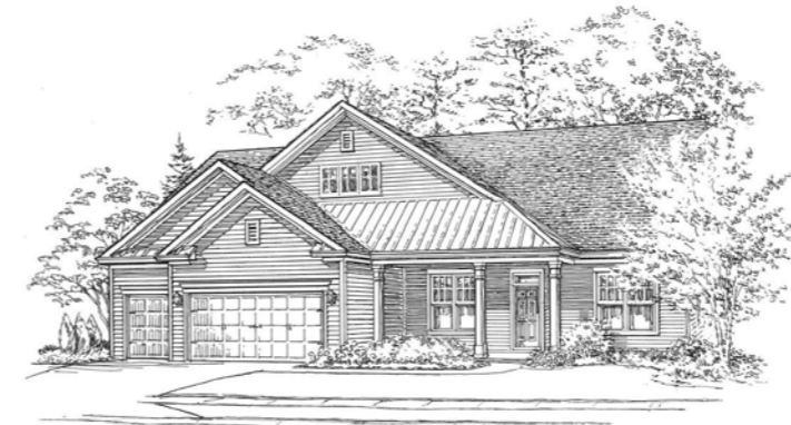
ELEVATION C Traditional