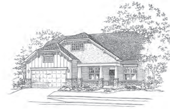
ELEVATION B Tudor