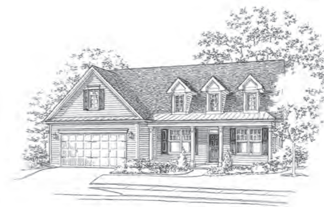
ELEVATION A Country Flair