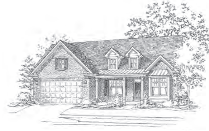
ELEVATION C Traditional