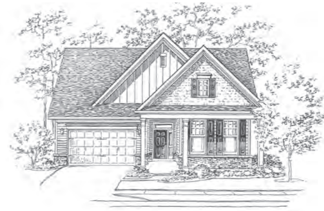
ELEVATION A Cottage Style