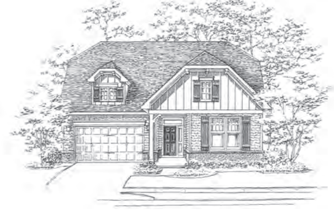
ELEVATION C Tudor