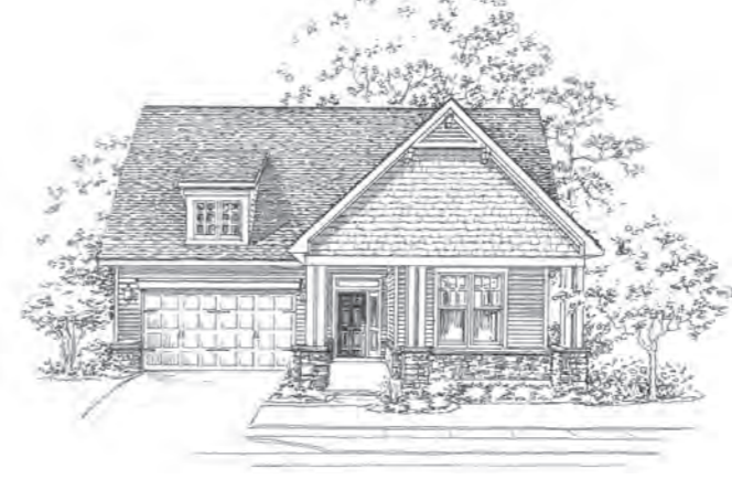
ELEVATION B Country Flair