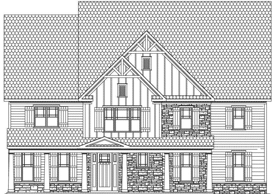
FRONT ELEVATION B 3372 SQUARE FEET