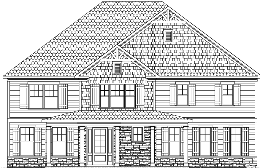
FRONT ELEVATION A 3362 SQUARE FEET